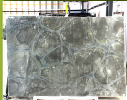
IN-STOCK SLAB PICK OF THE WEEK